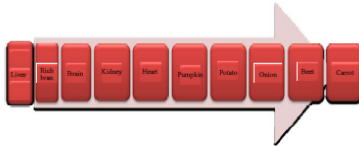
Fig. 2: The mixing order of additives